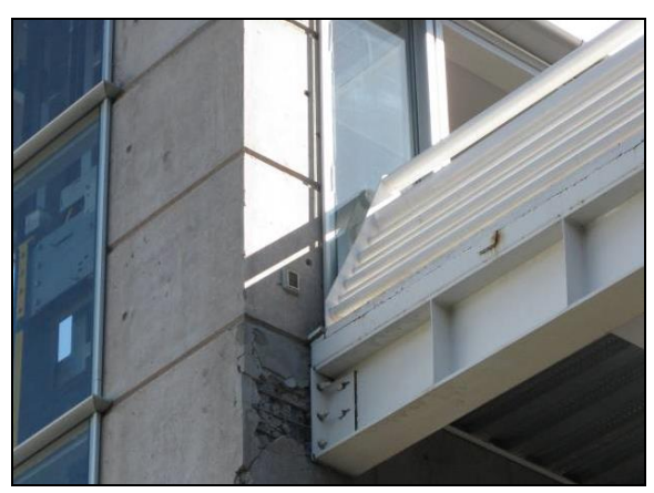
Damaged elevated walkway at Santiago International Airport, Chile, 2010; until repaired the area was off limits