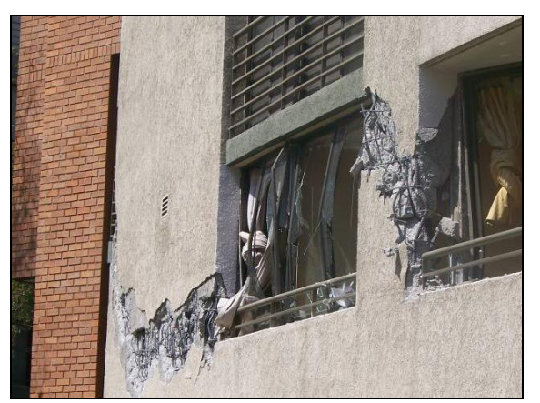
Damaged high-rise residential tower in Santiago, Chile, 2010, requiring substantial structural repairs