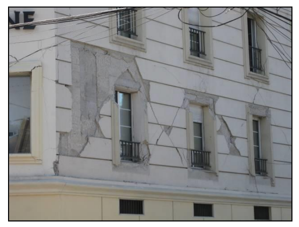
Extensive wall damage in office building in Port-au-Prince, Haiti, 2010, requiring extensive repairs before re-occupancy